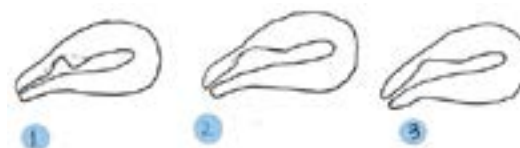
Fig. 3: Diagrammatic illustration of the procedure steps

All women were subjected to operative hysteroscopy, which was performed under general anesthesia, using glycine distension media, by using a 9mm, 30° angle lens, rigid resectoscope (Karl Storz GmbH and Co, Tuttlingen, Germany). Direct visualization of the uterine cavity to exclude other intrauterine pathologies was done. Then hysteroscopic niche resection was performed using a mono-polar resectoscope loop. Distal and proximal edges of the isthmocele were identified. The distal arch was resected first then the proximal arch until the bottom of the isthmocele reached the level of the cervical canal. And lastly the bottom of the isthmocele was treated using a 3-mm electro cauterization rollerball as demonstrated in (Figure 3) all procedures were performed by only one experienced surgeon.